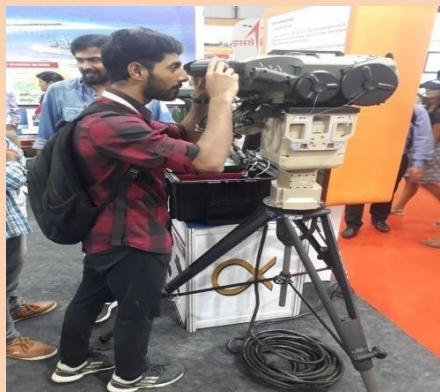
Students Experimenting During Field Visit