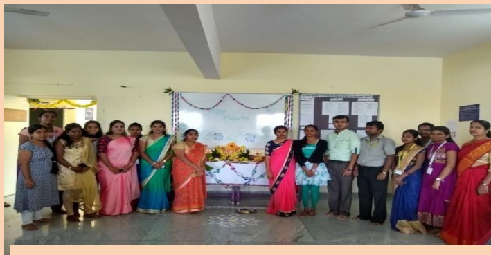
Dasara Celebration in The Department