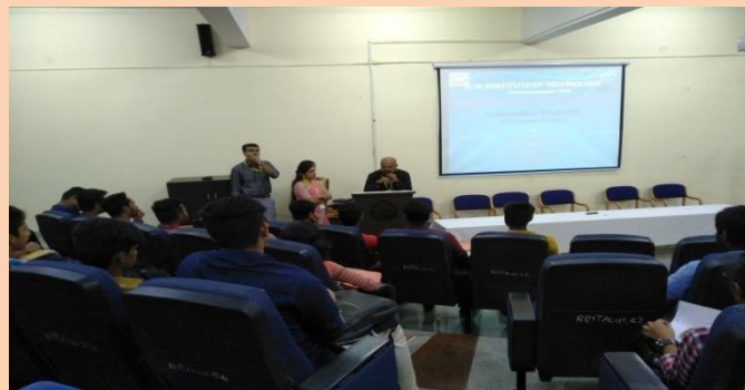
Orientation Program for 1 st Year Students