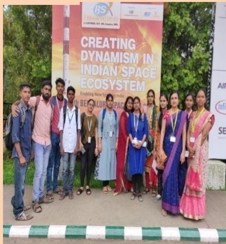
Students & Staff during Field Visit