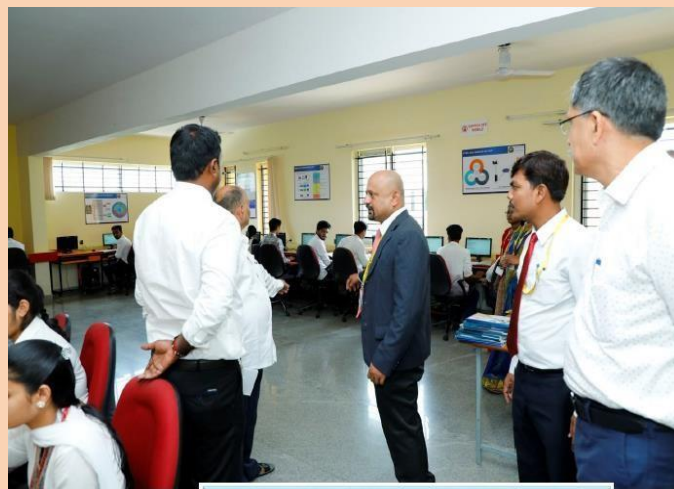
Department visit during the NAAC peerteam visit