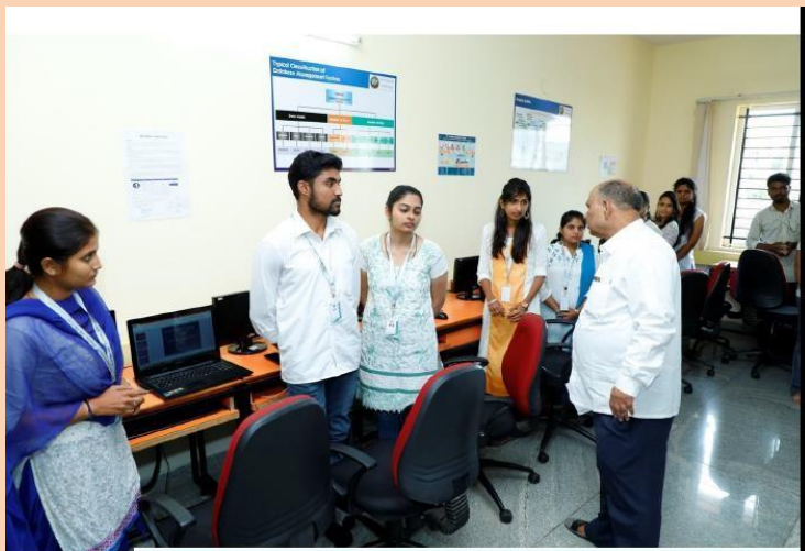
Students Interaction during the NAAC peer team visit