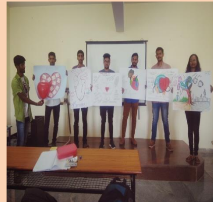
Students Participated during Heart Day