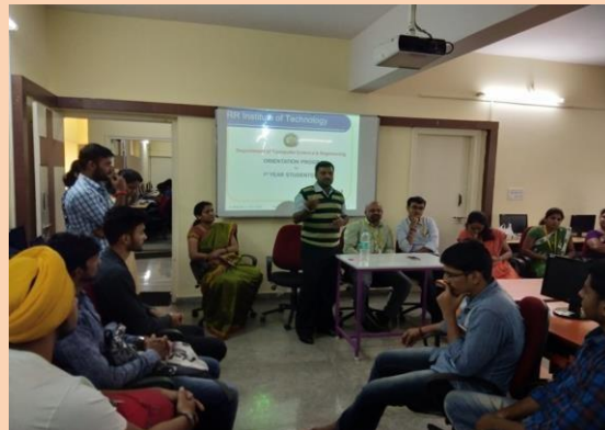
Orientation Program by Our Faculty